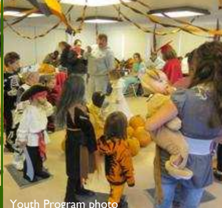
Everyone takes turns trying to win a prize in the cake walk.