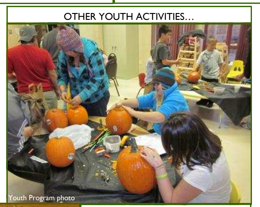
(Above) KBIC Youth held a pumpkin decorating night at the Niiwin Akeea Center on October 24th. Many families attended the event.

(Left) KBIC Youth painted Garbage Cans for Domestic Violence Awareness Month. The cans were distributed to different Tribal Offices and put out for Pop Can collection to help raise money for the OVW Support Group.