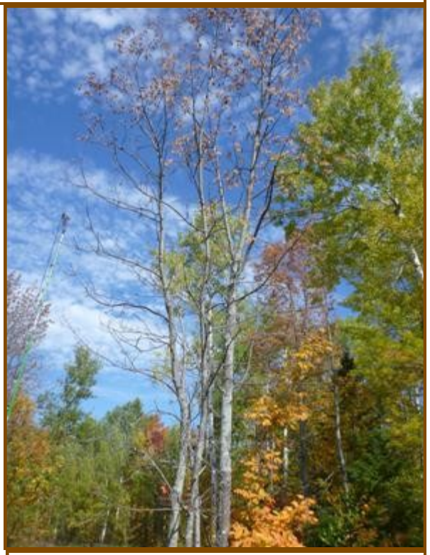
Ash tree with seed at top.

To collect the seed, which is typically at the very top of the tree, requires climbing the tree or using extended reach branch trimmers. Collection occurs during the fall after the leaves of the ash tree have fallen and seeds are exposed. "It's a good thing we went out when we did," remarks Plant Technician Karen Andersen, "with this recent wind much of the seed is probably gone now." Although there are 65 members of the ash family in North America, we are concerned with black and green