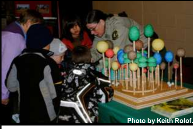
365 students attended the KBIC Environmental Fair.