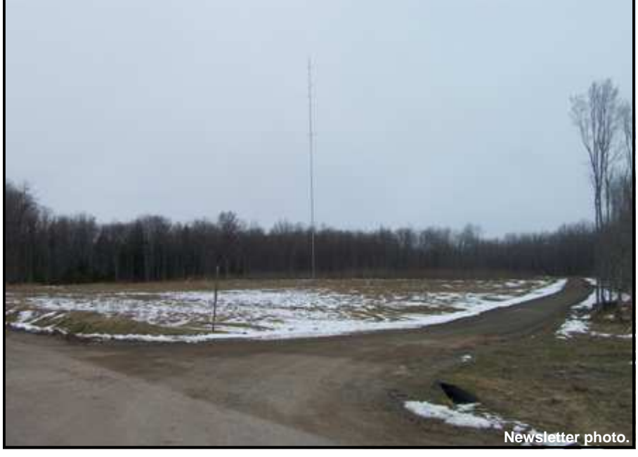
KEWEENAW BAY INDIAN COMMUNITY; BARAGA, MICHIGAN -April 18, 2011

The Keweenaw Bay Indian Community is erecting two wind monitoring towers to assess the wind capacity on the Reservation. Under a grant received from the U. S. Department of Energy, KBIC will place one monitoring tower at Buffalo Fields in Zeba and a second tower in the Ojibwa Industrial Park in Baraga.