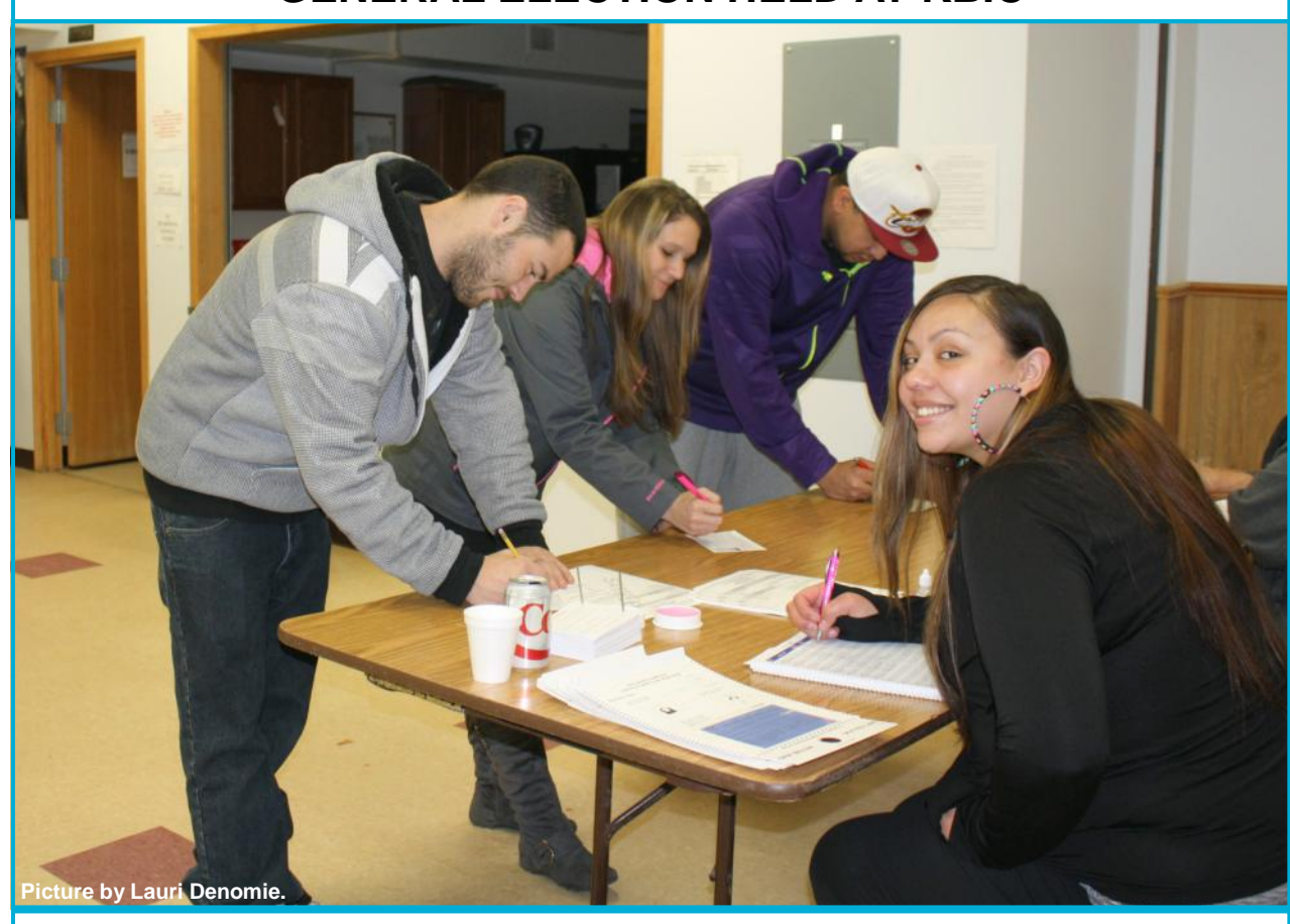
Voters registering at the Baraga District with Election Workers.

The Keweenaw Bay Indian Community held their General Election on Saturday, December 13, 2014. Baraga District voters cast their ballots at the Ojibwa Senior Center, and L'Anse District voters cast their ballots at the new Zeba Community Hall. A Primary Election was held on November 1, 2014, for the L'Anse and Baraga Districts which put the top four candidates in each district on the ballot for the General Election.