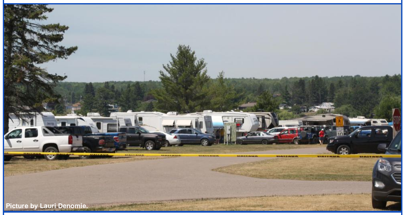
Sandpoint Campground, July 4th. Kiddie Parade participants (below).